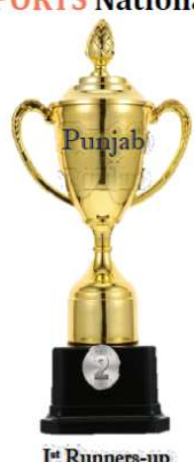
I<sup>st</sup> Runners-up 176 Silver