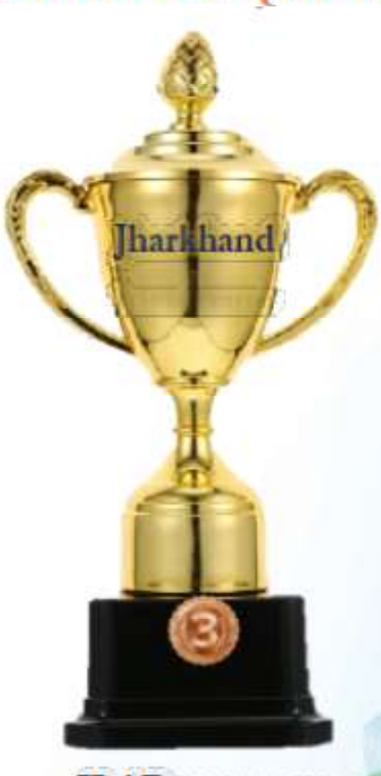
II<sup>nd</sup> Runners-up 100 Bronze